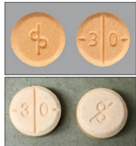
Figure 20. Legitimate Adderall Tablets (Top) and Counterfeit Tablets (Bottom) Containing Methamphetamine